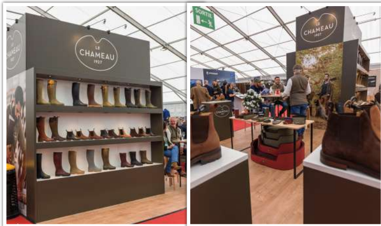
2 Custom-made stand made by a stand builder