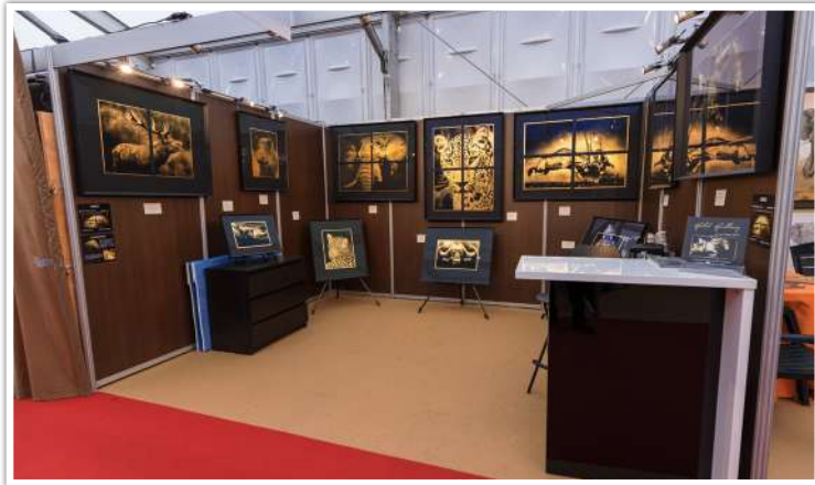
1 12m 2 stand = 4x3m